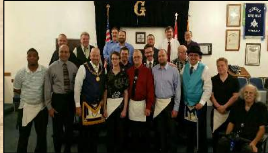
Fellowcraft Degree on May 11 th at Glendale Lodge No. 23