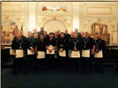
May 15 th Entered Apprentice Degree at Downtown Lodge No. 86