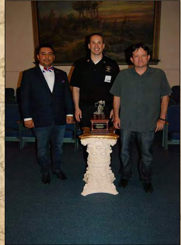
Trembath Memorial statue presented at Arizona Lodge No. 2