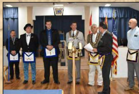
Two 50 year Pin presented at Gila Valley Lodge No. 9 on May 8 th