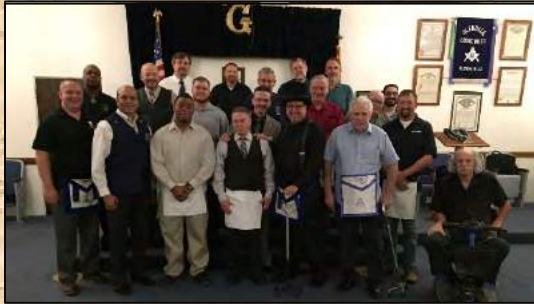
Master Mason Degree at Glendale Lodge No. 23