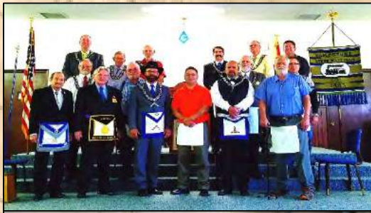
Master Mason Degree on April 29 at Camp Stone Lodge No. 77