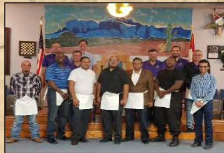
Courtesy Degree for Prometheus Lodge No. 87 at Chandler Thunderbird Lodge No. 15 on May 10 th