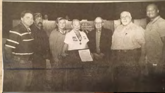
Gila Valley Lodge No. 9 makes the newspaper for their part in the Purple Heart proclamation