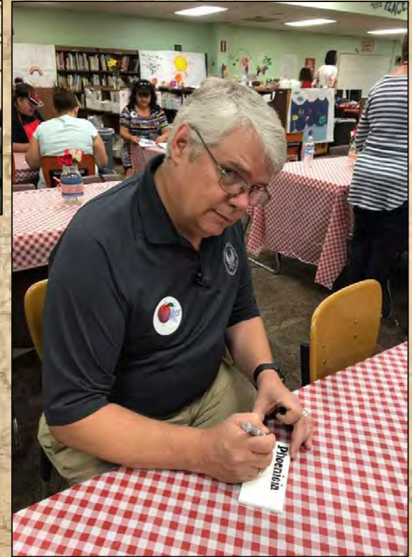
Volunteer Appreciation day with Phoenicia No. 58