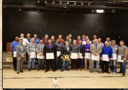
Education Night on April 25 at Prometheus Lodge No. 87