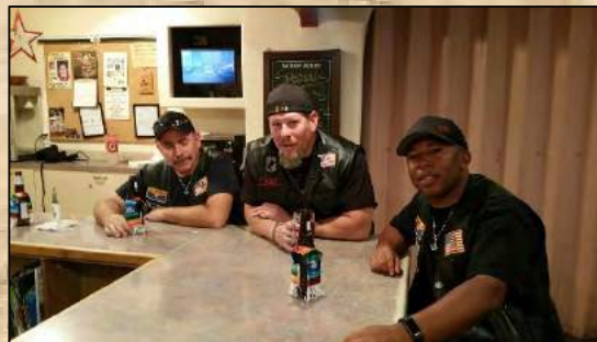
Sabbar Shrine visit by Downtown Lodge No. 86