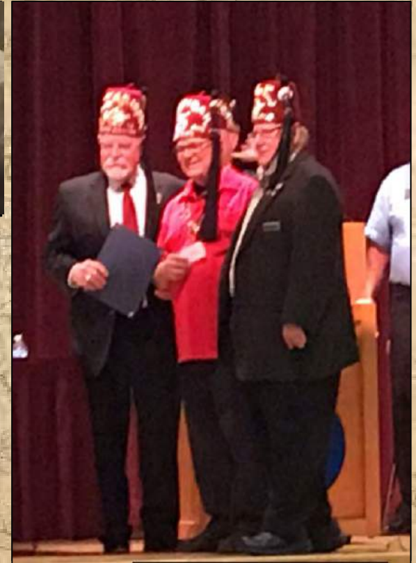
50 year pin presented for the Grand Lodge of Washington at the May El Zaribah Stated Meeting