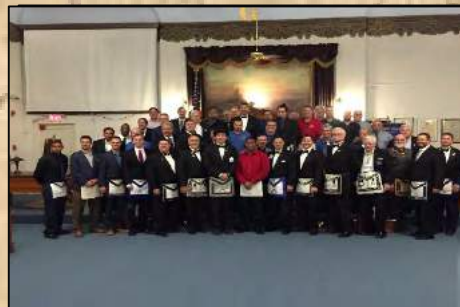
Sitting Master Night at Arizona No. 2, Degree for Glendale No. 23 on May 16 th