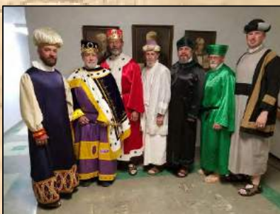
2017 Scottish Reunion in Tucson