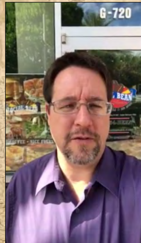
Shout Out for Wednesday Coffee at Social Bean for Havasu Lodge No. 64