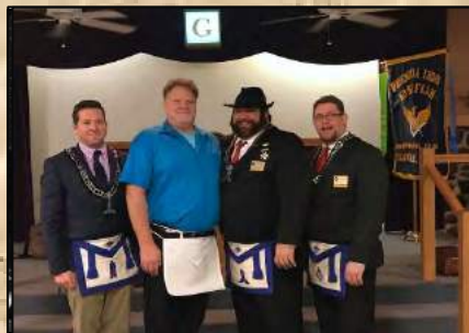
Master Mason Degree at Phoenicia Lodge No. 58