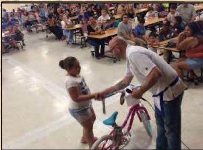
Bikes for Books at Yuma Lodge No. 17