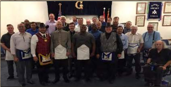
Double EA Degree on April 27th at Glendale Lodge No. 23