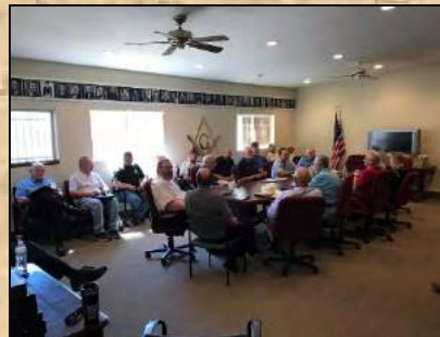
Grand Lodge Meeting on May 20 th