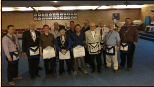
Double Entered Apprentice Degree on May 10 at Pinal Lodge No. 30