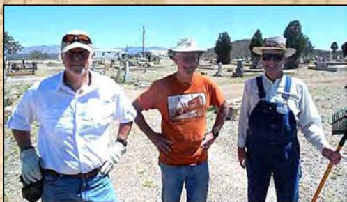
Cemetery cleanup on Earth Day at King Solomon Lodge No. 5.