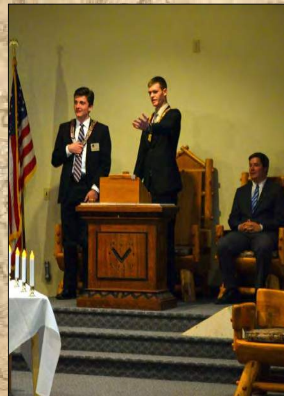
Yavapai Chapter of the Order of Demolay Awards Parents Night May 8th, 2017 at Aztlan No. 1