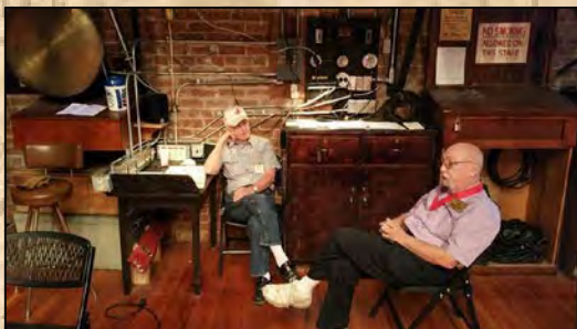
Backstage at the Tucson Scottish Rite Spring Reunion