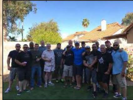
Grillin and Chillin day at Downtown Lodge No. 86